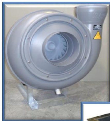
CMVeco Direct Drive Fan